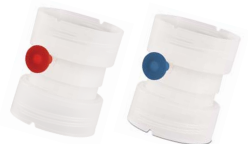
Catalogue Number: 010-500-070